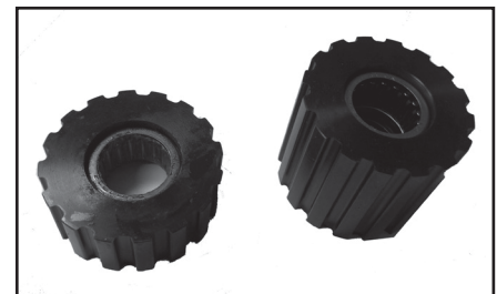
For idler pulleys, see page 366.